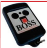
Key-Ring 310MHz Remote Control Transmitter